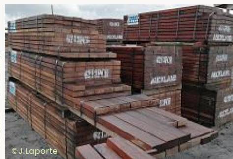
Support for the traceability system in Guyana