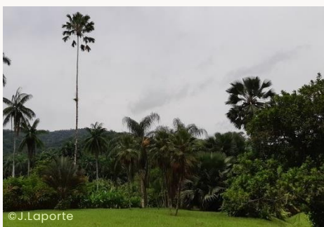
Since 2015, Honduras has lost 12.5% of its forest area.