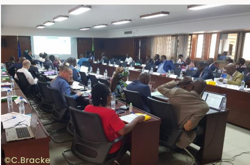
Introduction of the Five-Year Plan to the CCM in Congo