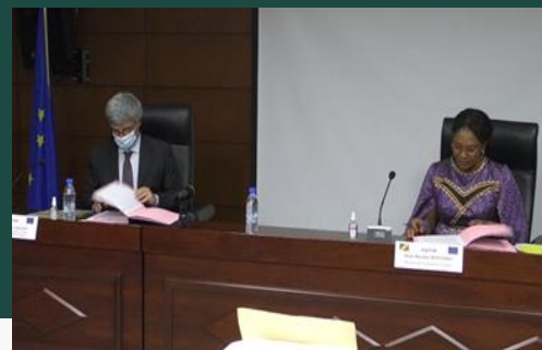
Presentation of the EU FLEGT VPA Programme at the Carrefour International de Bois in Nantes