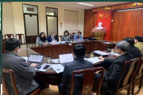
Meeting in Vietnam with the Forestry Administration