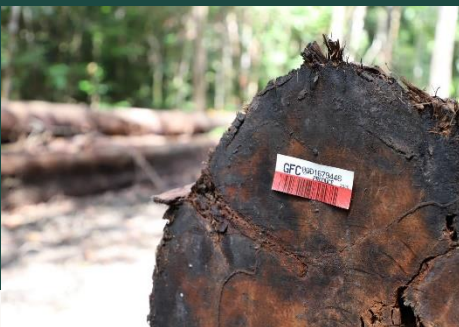
Traceability system in Guyana