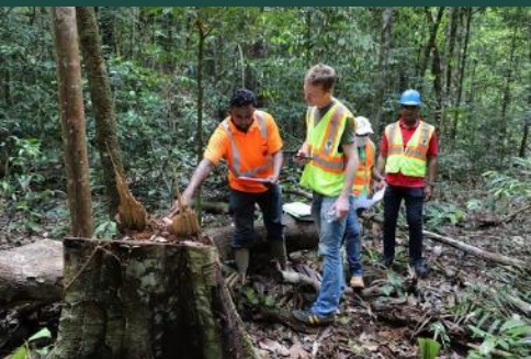
Field mission to Guyana with EFI